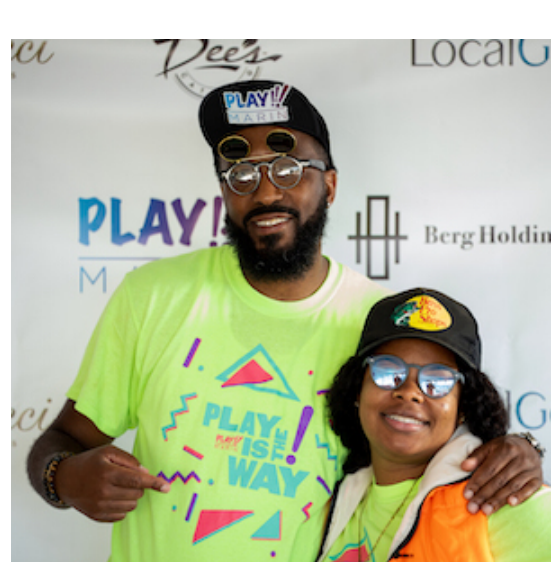
Play Marin's Player's Night