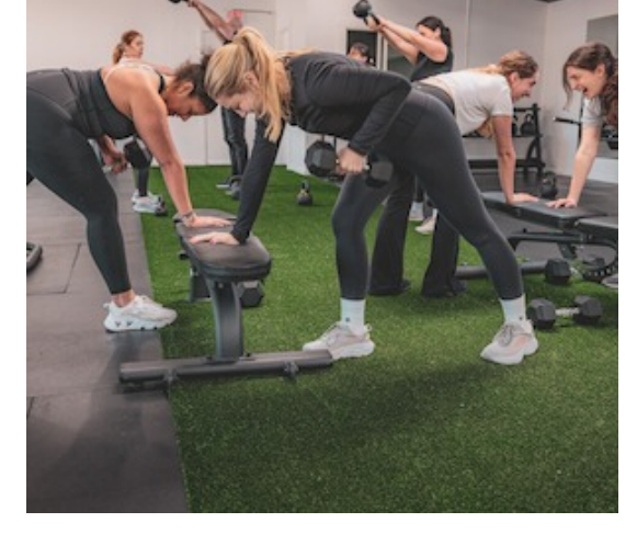
The Yard in Mill Valley and Other New Wellness Businesses